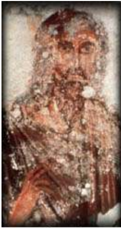
Portrait of Jesus from the catacombs