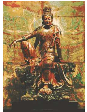
Chinese sculpture of the Bodhisattva of Compassion, Avalokitesvara (Guanyin)