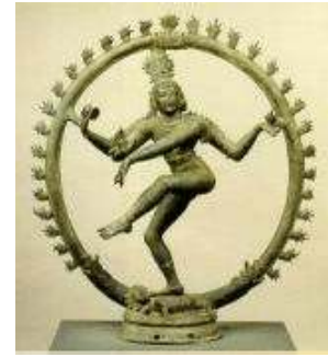
Shiva, the "erotic ascetic"