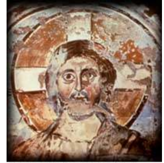
Jesus as Christ (catacomb painting)

These pictures come from the PBS website for the film, From Jesus to Christ , which contains much written material that is not in the film.