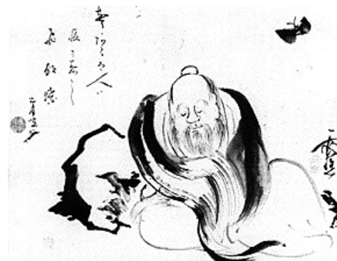
Zhuangzi dreaming of the butterfly, or vice versa.