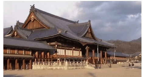
Tenrikyō main temple (Tenri City)