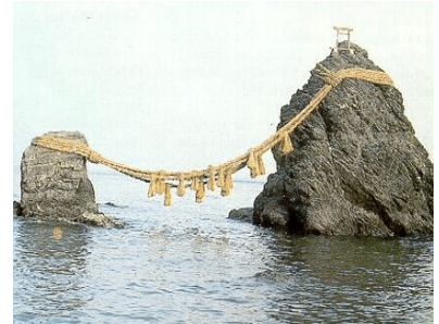
Off-shore rock kami.

Film: "New Year's Rituals at Tsubaki Grand Shrine"