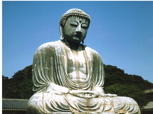
The Great Buddha ( Daibutsu ) at Kamakura (Amida Buddha).