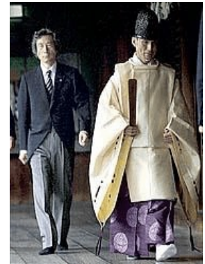
..Prime Minister Koizumi's visit to Yasukuni Shrine.