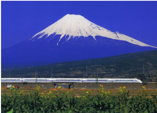
Mt. Fuji and the Shinkansen (bullet train)

This course is a historical and contemporary survey of religious life in Japan, focusing on the Shinto and Buddhist traditions. We will pay special attention to the ways in which religious ideas, values, and practices are integrated into the common forms of Japanese culture today. Classes will be a mixture of lecture and discussion, supplemented by films.