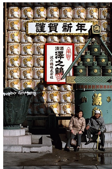
New Year's display of sake at a Shinto shrine.