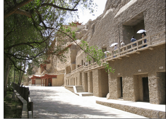
The Mogao Caves (Dunhuang)