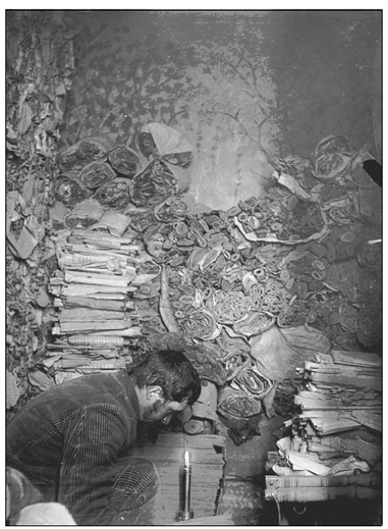
Paul Pelliot examining manuscripts in the Library Cave at Dunhuang (1908).