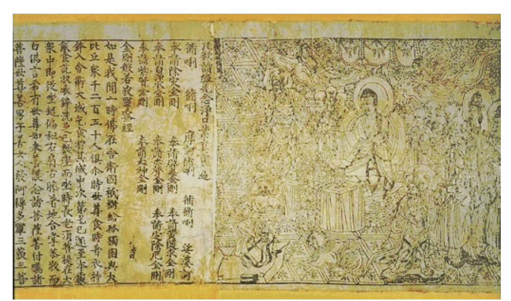
First section of the world's oldest dated printed book (868 C.E.): the Diamond Sutra found at Dunhuang, China.