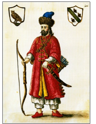
Marco Polo in Mongol dress