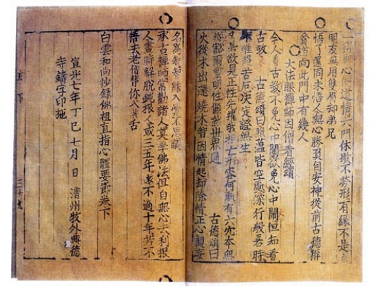
The earliest extant book printed with moveable metal type (1377).